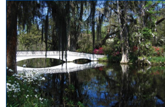
Take in the Picturesque Views of Charleston

Day 5: Enjoy a Continental Breakfast before departing for home... a perfect time to chat with your friends about all the fun things you've done, the great sights you've seen and where your next group trip will take you!