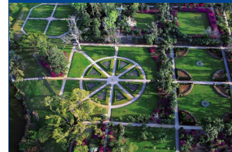
Visit Middleton Place and Gardens